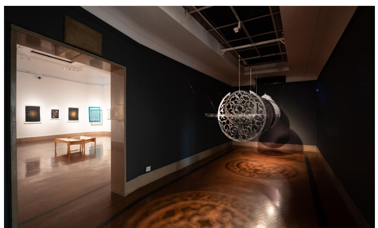
Installation view of Manifesting the Unseen