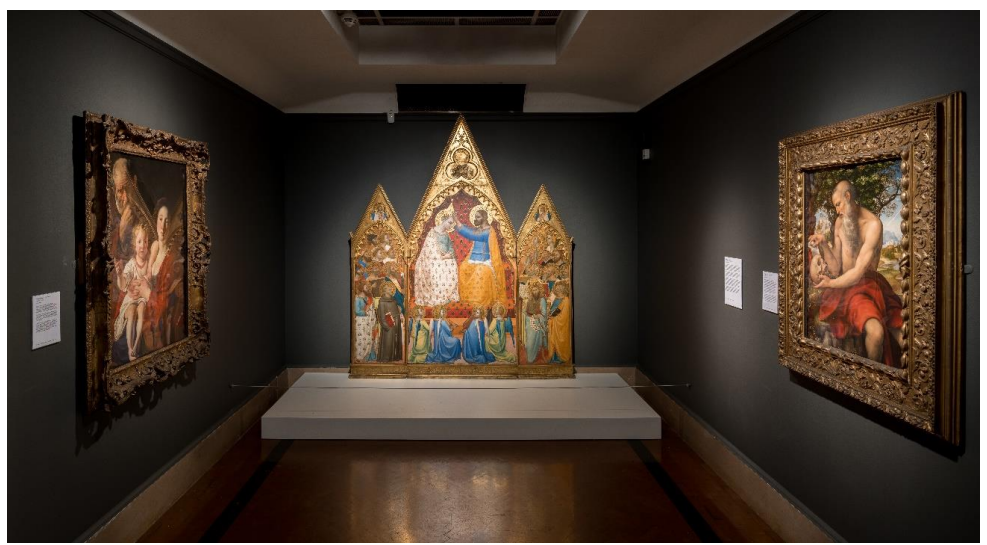
The Renaissance Room, installation view, February 2022