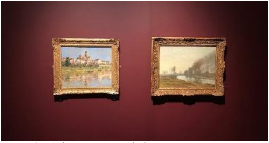
Both Monet's on display in Creating a National Collection

• The frame for Claude Monet's The Church at Vétheuil which had been sent for conservation in October 2020 was displayed in its conserved state for the first time in the Creating A National Collection exhibition (28 May – 4 Sept 2021) alongside another Monet from the National Gallery, The Petit Bras of the Seine at Argenteuil .